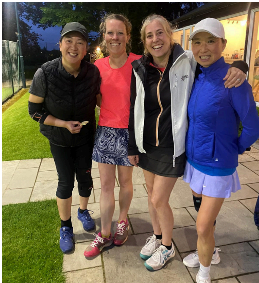
Merrow Ladies B Team players after beating Woking B 5 sets to 3

Merrow Ladies B are also in league division 2; having been promoted last season and are currently in 4th position of 10.