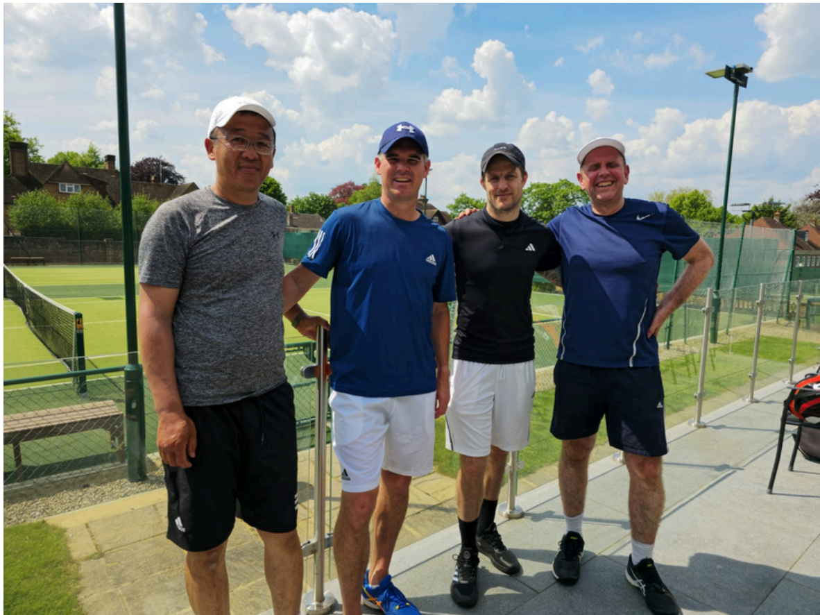
Merrow Men's Premier Team Players at Pit Farm

Congratulations to our Men's Premier Team playing in the Chaucer League. They have had a great start beating Pit Farm 2nd team 8-1 at Pit Farm and then their 1st team 6-3 at Merrow!